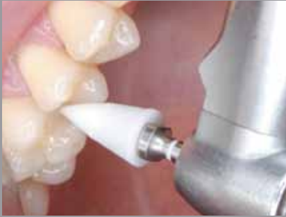
Removes cement or composite flash Removes intrinsic stain