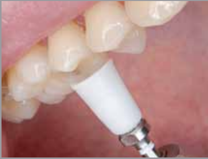
Finish and polish in one step Does not scratch enamel